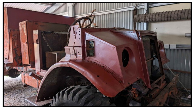
The Blitz undergoing restoration